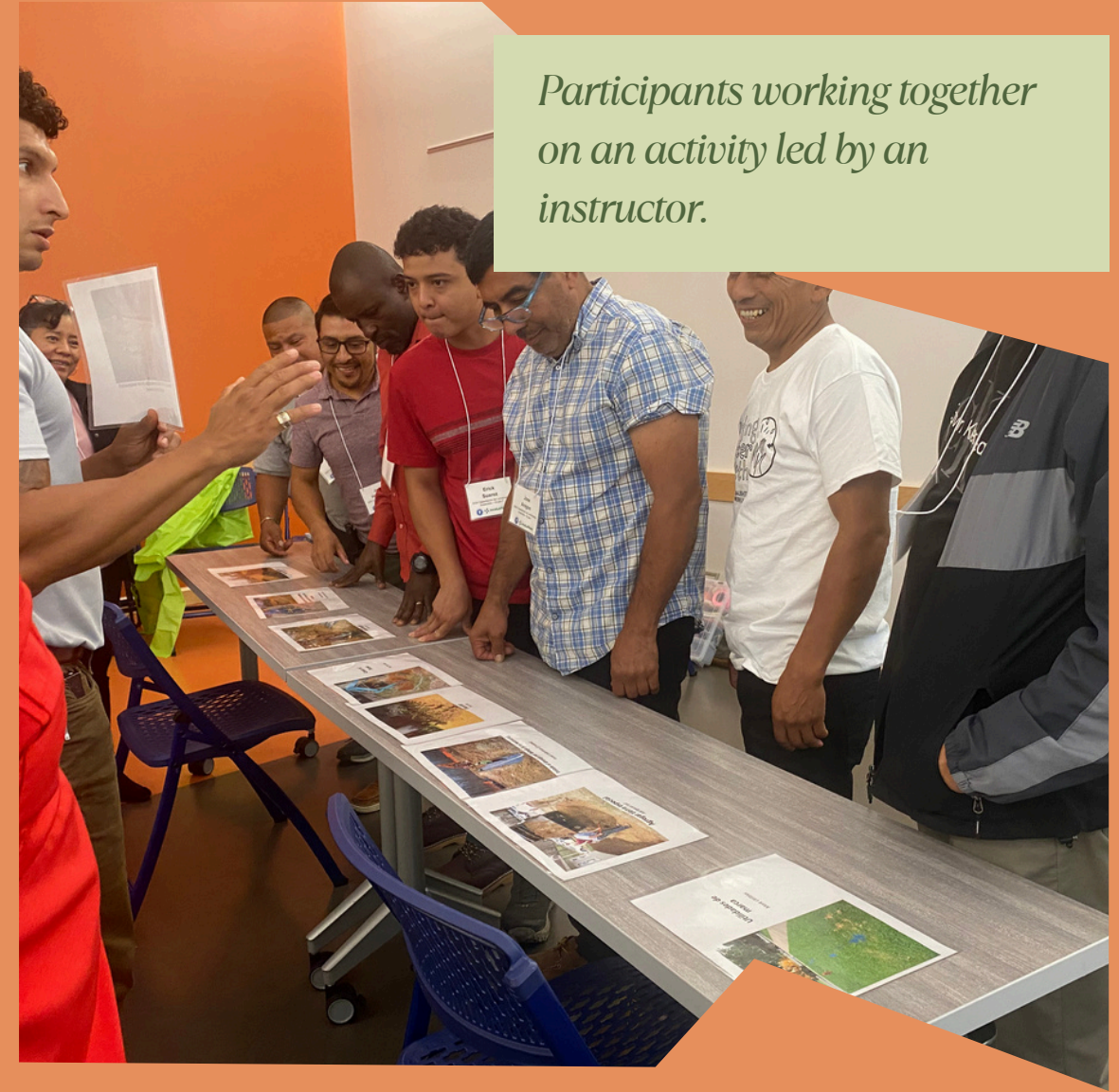
Participants working together on an activity led by an instructor.

On the first day of the program, participants heard lectures and watched videos on different topics, such as the Chesapeake Bay watershed, Best Management Practices (BMPs), rain gardens, conservation landscaping, plant identification, and green infrastructure careers. They also had field exercises that allowed them to see and learn of BMPs at the locations where the trainings were held – the Hyattsville and Bladensburg libraries in Prince George's County.